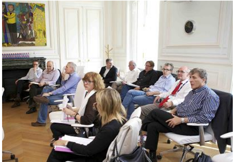
CERC Advisory Board