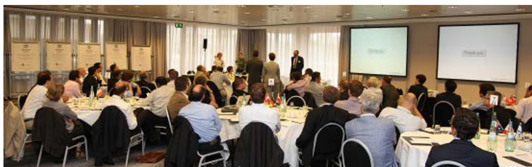
Leaders Free Investigators' meeting in Frankfurt

On September 10, the first LEADERS-FREE investigator meeting took place in Frankfurt. 53 physicians from 23 countries in Europe, Asia and the Americas took part in an in-depth review of the project. Patient enrolment is due to start before the end of the year.